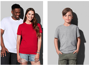
ST2020 Classic-T Organic ST2220 Classic-T Organic